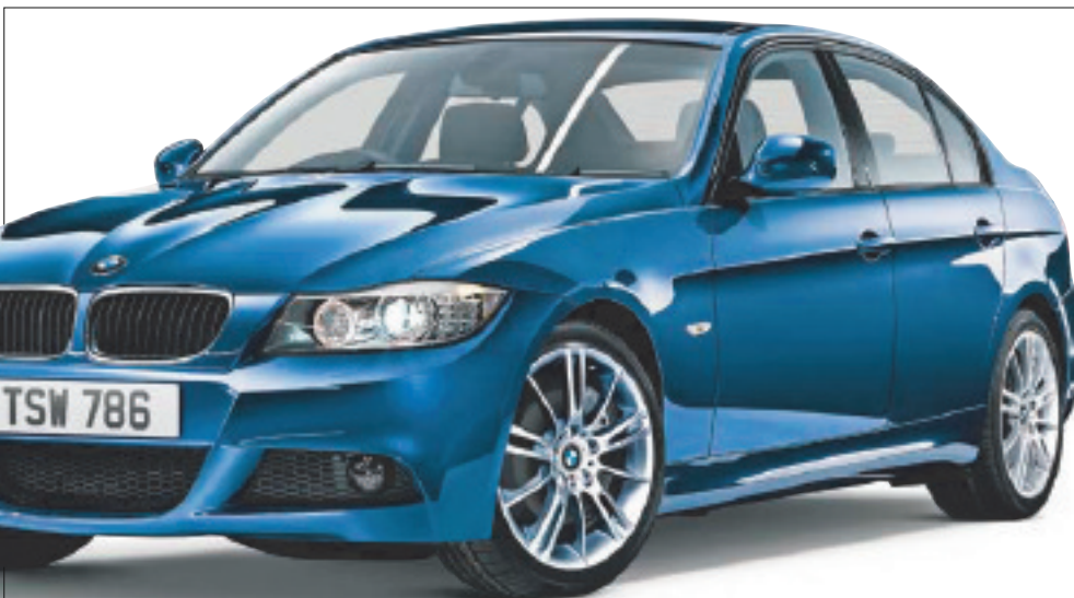
The BMW 3 Series Saloon and Touring

If you are a sheddies with a great shed and think you can compete with the previous winners, why not share it now at www.readersheds.co.uk